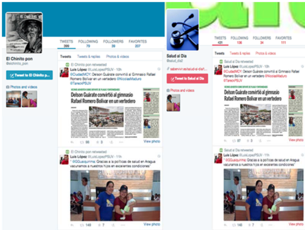
Figure 3: Screenshot of Bot Accounts @salud_dia1 and @elchinito_pon Retweet Incident

produce content and mimic real users. Fake social media accounts now spread pro-governmental messages, beef up web site follower numbers, and cause artificial trends. Bot-generated propaganda and misdirection has become a worldwide political strategy.