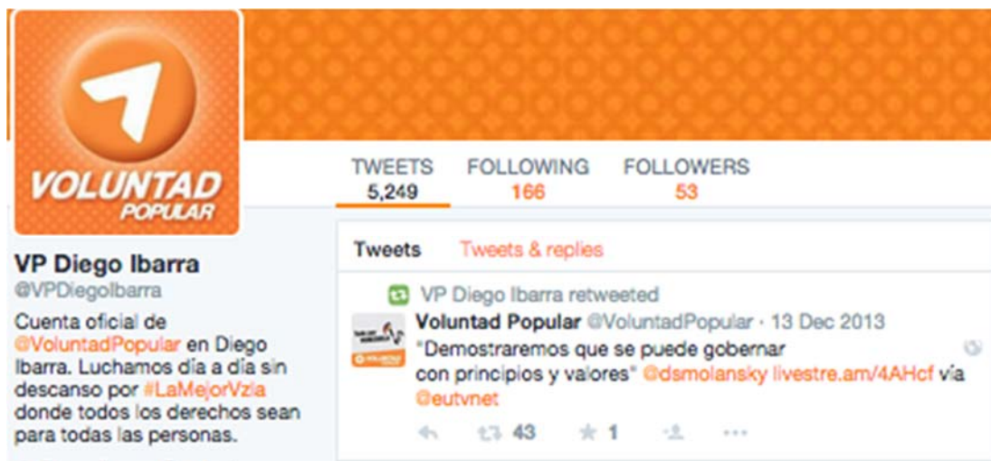
Figure 2: Screenshot of Bot Account @VPDiegolbarra

bot accounts represent themselves not as political candidates, but as VP party branches in different states and cities—they are branches of a party organization. For example, @VP_Carabobo is the account for the state of Carabobo, whereas @VPBejuma is the account for the small town of Bejuma in the state of Carabobo. Figure 2 is a screenshot of the @VPDiegolbarra account page, which is an account that represents the municipality of Diego Ibarra in the state of Carabobo. All of these bots used the Botize platform to retweet content. In addition, most of their usernames had embedded in them the term “VP”—the initials of the Voluntad Popular party.